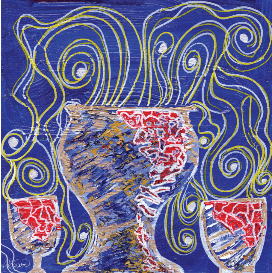
Posca by Carmelle Beaugelin | Acrylic on canvas | A Sanctified Art LLC | sanctifiedart.org