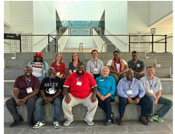
PAK Cohort at IAAM, October 2023

The IAAM is located at Gadsden's Wharf on the Charleston Harbor. The significance of this site is that from 1683 until 1808, over 200,000 men, women, and children arrived on slave ships at Charleston Harbor, making Charleston and our state of South Carolina the first place that many enslaved Africans saw in America.