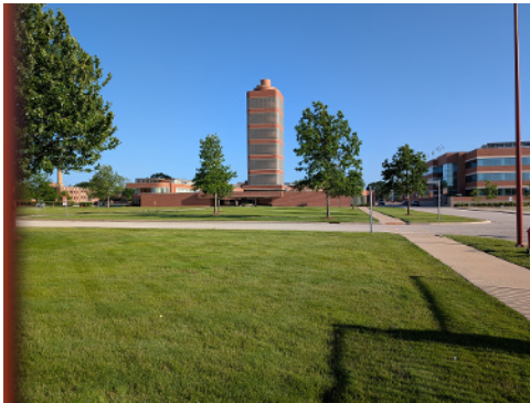
SC Johnson Research Tower Racine, WI