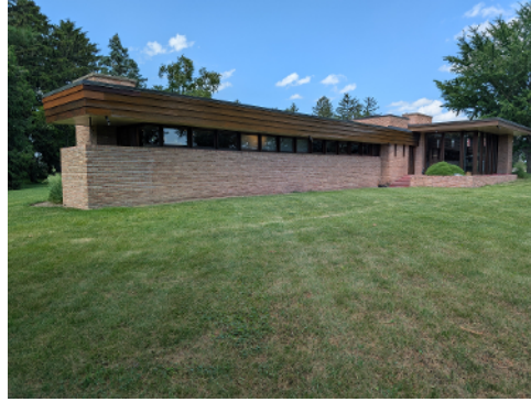
Muirhead Farmhouse Hampshire, IL