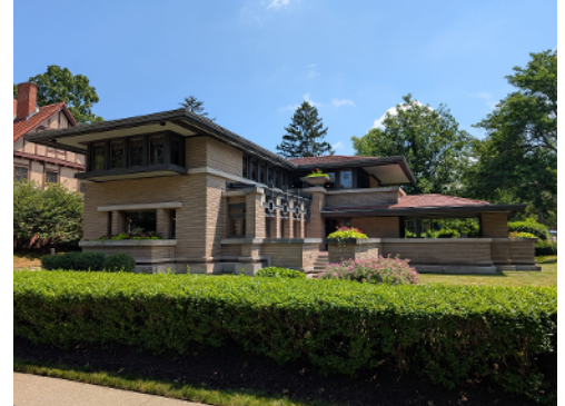
Meyer May House Grand Rapids, MI