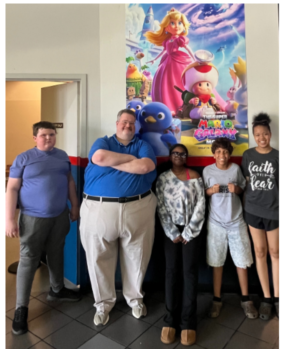
Youth Group at the movies during spring break!

On Communion Sunday, bring your donations to the Sanctuary. On any other day, donations can be dropped off in the barrel across from the choir room. Thank you for your extravagant generosity!